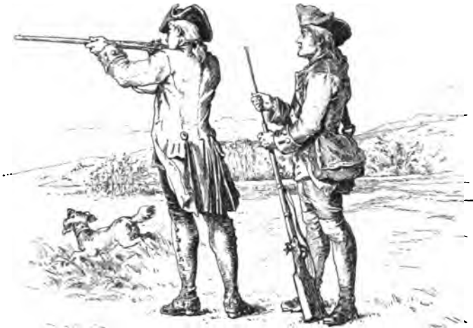
'Moriarty Carroll was always out hunting or shooting with him.'

The taste for vulgar praise grew by that it fed upon. Harry was in great danger of forgetting that he was too fond of flattery,—and too fond of company—not the best. He excused himself to himself, by saying that companions of some kind or other he must have, and he was in a situation where good company was not to be had. Then Moriarty Carroll was gamekeeper, and Moriarty Carroll was always out hunting or shooting with him, and he was led by kind and good feelings,